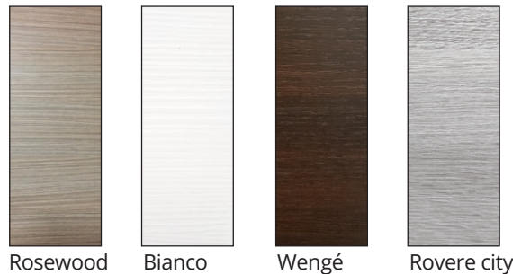
Rosewood Bianco Wengé Rovere city